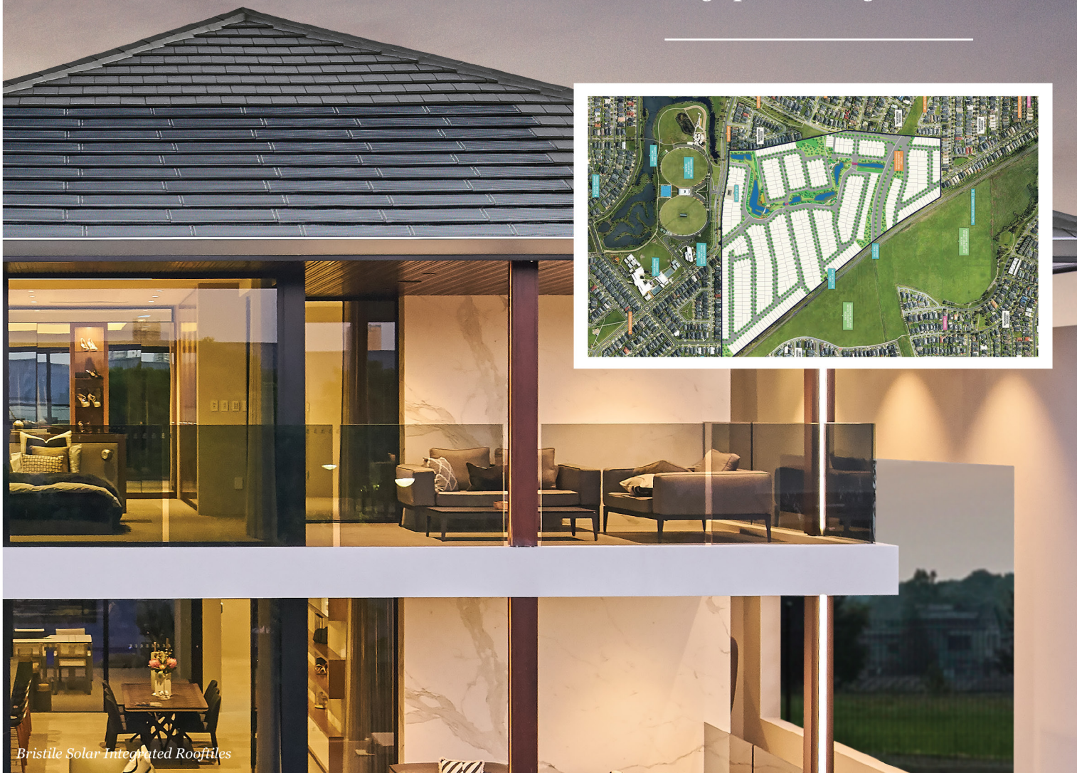
Bristile Solar Integrated Rooftiles

The project is being developed by Villawood Properties and state-owned utility South East Water, and will offer buyers of the Aquarevo homes the option of 5kW of rooftop solar, plus battery storage provided by sonnen.