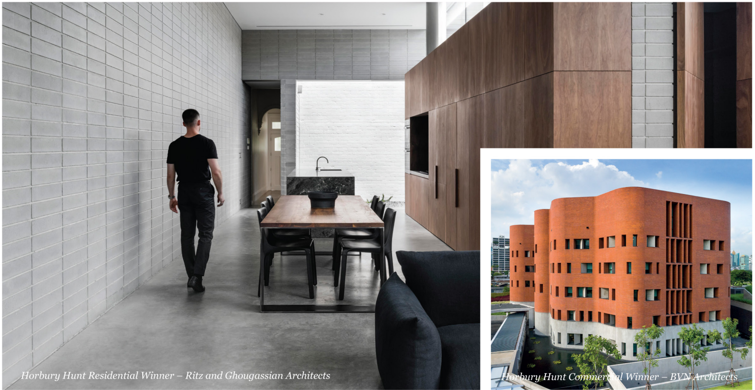
Horbury Hunt Residential Winner – Ritz and Ghougassian Architects